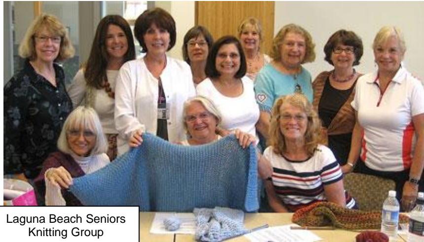
Laguna Beach Seniors Knitting Group

THE LAGUNA BEACH COMMUNITY FOUNDATION GRANT TO LAGUNA BEACH SENIORS HELPED FUND SOCIAL WORK SERVICES TO HELP SENIORS LIVE FULLER, SAFER AND MORE INDEPENDENT LIVES. PROFESSIONAL CASE MANAGERS ARE ON-SITE TWO DAYS A WEEK TO MEET INDIVIDUALLY WITH CLIENTS AND TO VISIT HOME-BOUND SENIORS. CASE MANAGERS HELP WITH HEALTH CONCERNS, NUTRITION, MEMORY LOSS, SOCIALIZATION, DEPRESSION, LONELINESS, ANXIETY, AND LINK CLIENTS TO RESOURCES NEEDED TO LIVE A SAFE AND INDEPENDENT LIFE. CLIENTS ALSO SEEK INFORMATION ABOUT INSURANCE, FAMILY SUPPORT PROGRAMS, REFERRALS FOR DISABILITY SERVICES AND PRODUCTS, LEGAL ASSISTANCE AND TRANSPORTATION SERVICES. THE GRANT ASSISTED THE SUSI Q IN ADDING A NEW COUNSELOR WHO IS ABLE TO PROVIDE COUNSELING IN SPANISH.